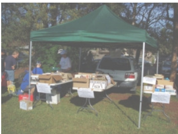
Our stand at the market